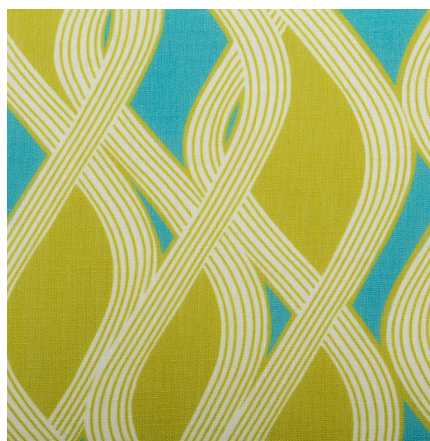
Preakness Printed Example